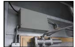
Electronic logic system

The Single Knife Edge ™ (SKE) Door with electro-latch semi-automatic operation comes in a heavy duty Series 201 model and offers superior knife edge door reliability, performance and longevity. The SKE Door features a precision formed knife edge, a proven Recessed Contact Mechanism (RCM), and a motorized two-point latching system to deliver reliable shielding, exceptional performance, convenient operation, and easy maintenance.