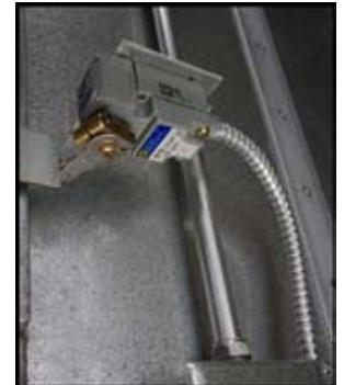
Door close activation switch