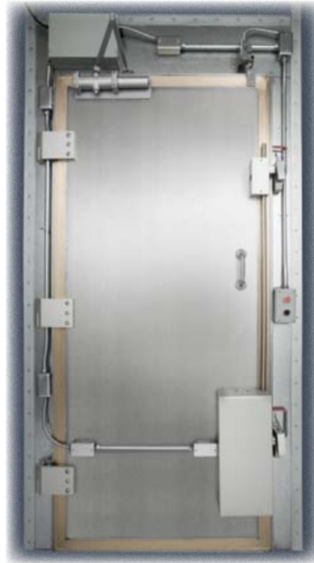
Series 201 Electro-Latch Door